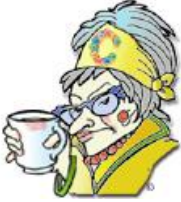
Crabby Office Lady

We all know (or should know) that Project is the must-have program for anyone trying to manage a, well, project. And while the previous versions have done a good job of helping you do this, Office Project 2007 has some new features that will have you wondering how you got along without them in the first place.